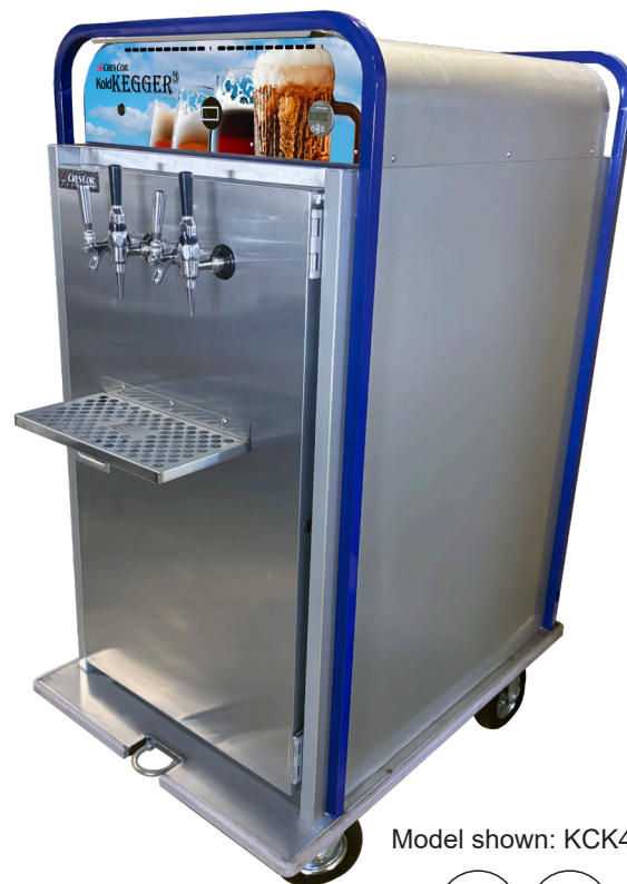
Model shown: KCK4