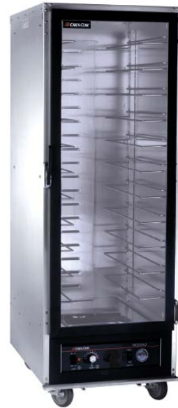
131-UA-11D (Shown with optional Lexan door)