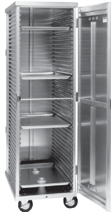
102-ST-1841E (Pans not included)