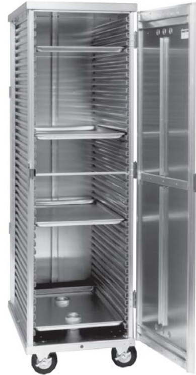
102-ST-1841E (Pans not included)